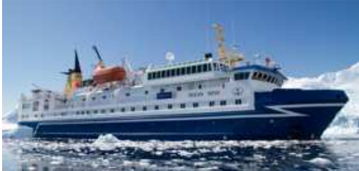
Vessel OCEAN NOVA

Ocean Nova is a modern and comfortable vessel. She was built in Denmark in 1992 to sail the ice-choked waters of Greenland, and her ice-strengthened hull is ideally suited for expedition travel in Antarctica. Ocean Nova has capacity for 68 passengers accommodated in comfortable outside cabins, all with private facilities, including dedicated single, and twin.